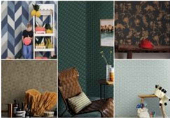
CREATING THE WORLD